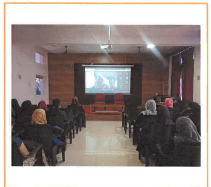
Student's participated in the Webinar